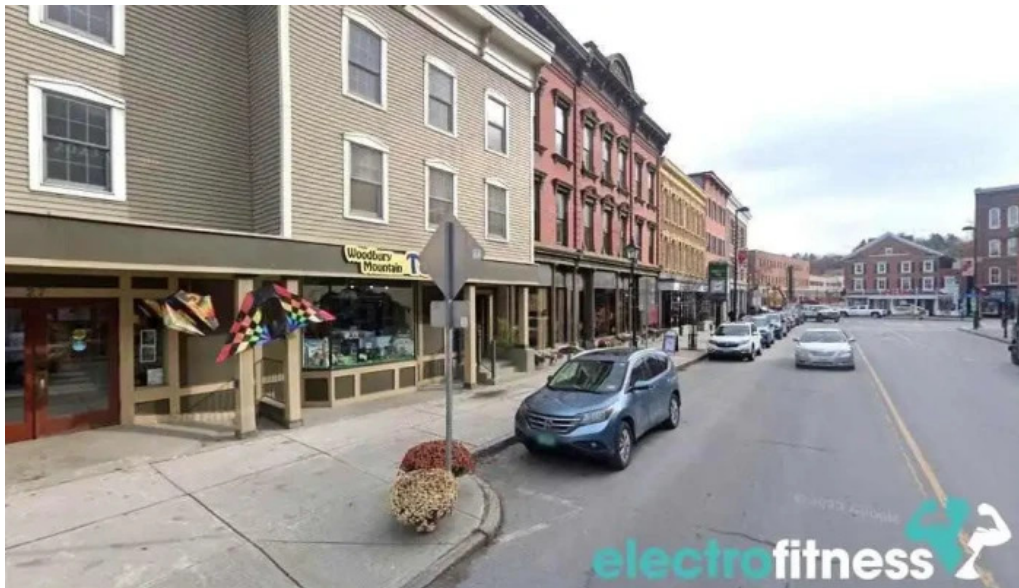
Old school yoga montpelier