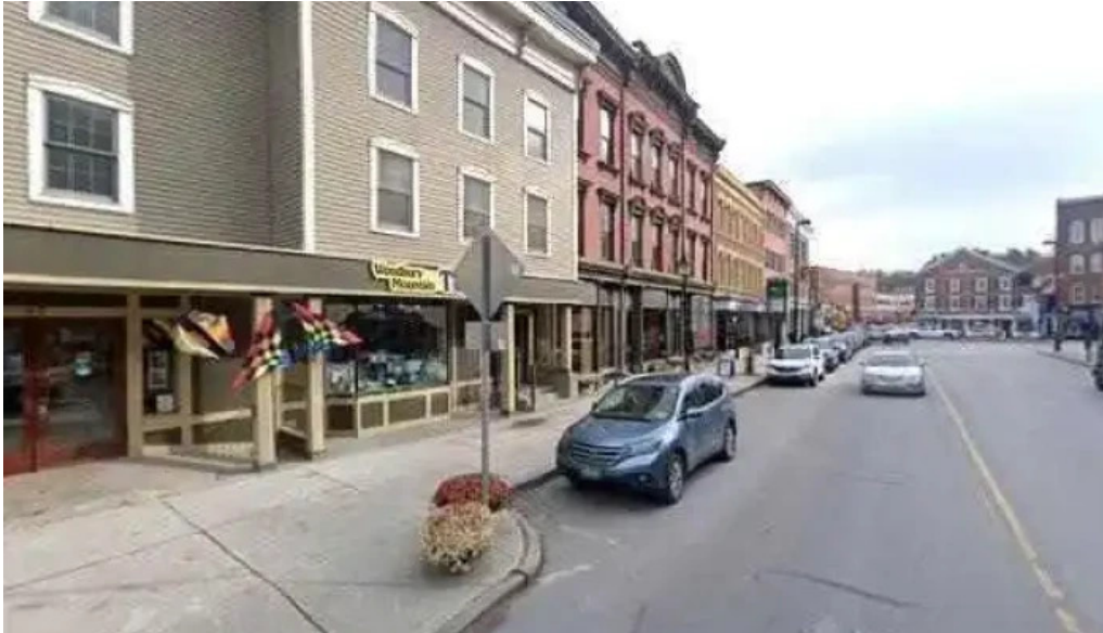
Old school yoga all