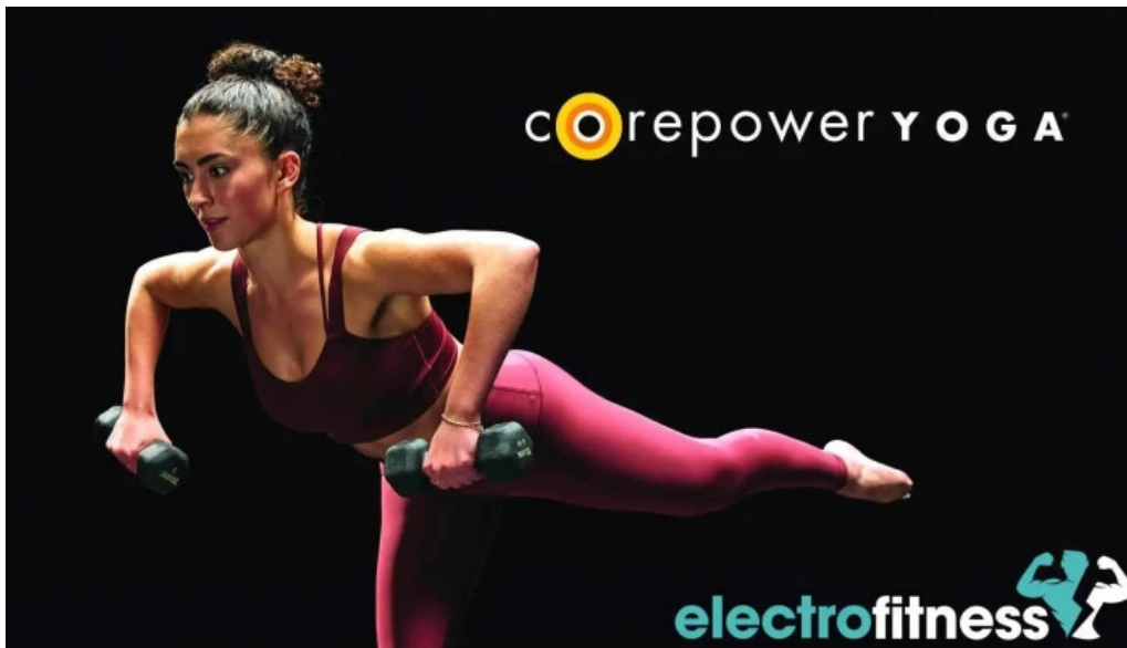
Corepower yoga walnut creek all