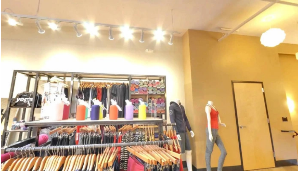
Corepower yoga walnut creek street view 360deg