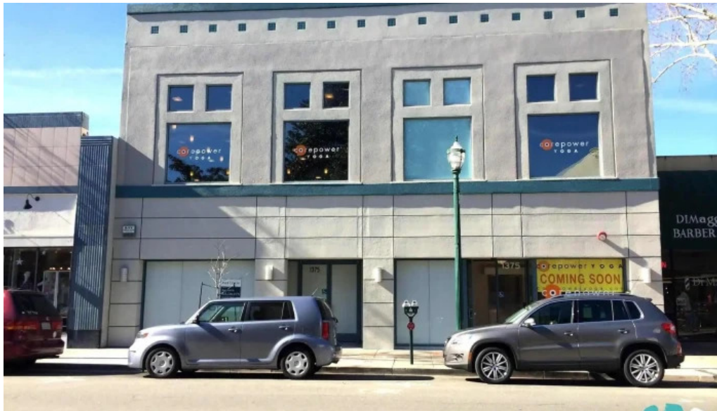
Corepower yoga walnut creek by owner